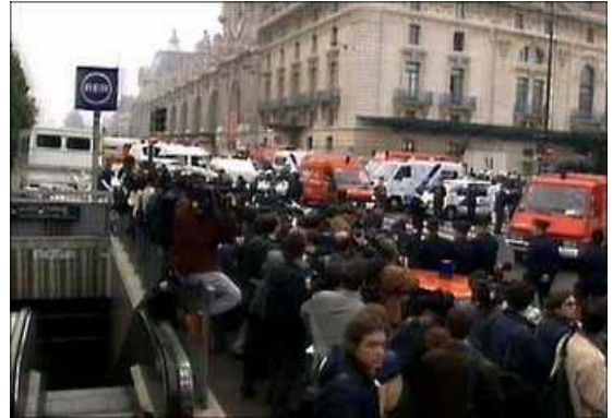
October 1995 canister bomb attack on the Paris Metro system

1995: the truth is that I have nothing to do with these bombings. In fact, this is the first time I have ever heard about my involvement in these bombings. This is so despite the fact that it is indeed true that I wrote articles in Al-Ansaar [Magazine] and supported the jihad in Algeria—and, please note that I still support this jihad against the traitor apostate government as long as it is in accordance with the conditions of Islamic Shariah. I supported the mujahideen when they attacked the French at that time because it was their retaliation for her blatant support of the revolutionary government that [undermined] the victory of the Islamic Salvation Front (FIS) in fair elections. This was also in retaliation for the fact that the French intelligence forces took part in the war against the mujahideen. I hereby reveal that I was indeed the one who drew the famous picture of the Eiffel Tower blowing up, while debris in the form of the GIA [Algerian Armed Islamic Group] book with the cover of Al-Ansaar Magazine flew all over. However, this was after the bombings took place rather than prior to them. This can be verified by looking back at the dates. I had nothing to do with these attacks... not a green light nor a yellow light. However, of course, neither was I the one to give them a red light with regards to these bombings!”