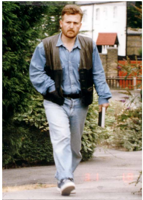
Captured Al-Qaida terrorist mastermind Abu Musab al-Suri (a.k.a. Mustafa Setmariam Nasar, Omar Abdel Hakim)

“To further elaborate... we all know very well that the mujahideen leader Usama Bin Laden clearly warned the United States and the other Western nations in mid-1996 that they must withdraw their armed forces and put an end to their attacks. Throughout the past decade, Shaykh Usama [Bin Laden] and Dr. Ayman [al-Zawahiri] have both pleaded with the U.S in particular—as well as the Western world in general—to stop their aggression on our countries and stop the ongoing occupation of our land. As we all know, our pleas went unanswered, and no one heeded our warnings. Consequently, the war began and the mujahideen resorted to using their weapons as the preferred means of communicating with the enemies...”