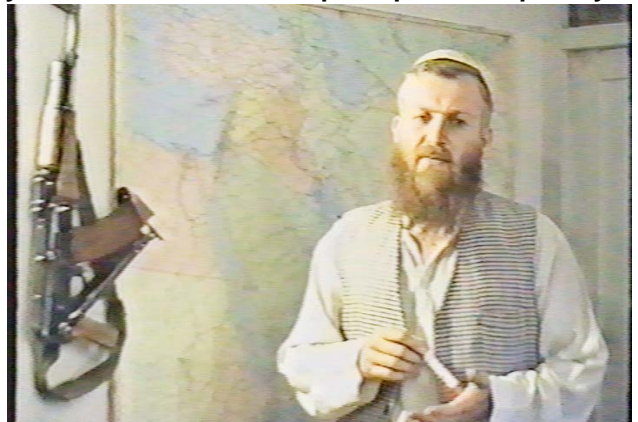
Abu Musab al-Suri in Afghanistan

“We call the leaders of these countries to rule with common sense. We call them to be humane and take the interests of their peoples and their nations into consideration. It is not in their interests to continue to be a part of this alliance of aggression and crime. They must have their own independent policies and withdraw themselves from this pathetic world war... if Blair, Berlusconi, and their counterparts insist on continuing this war, they should know the strategic principles that guide us, and according to which we formulate our policy... We consider the battle to be against a single entity that is comprised of all the allies. As far as we are concerned, America is the same as Israel, Britain, Poland, Italy, and the others. They are an alliance, and as such, they are all accountable for their actions. Each and every enemy country will be treated as a part of a larger entity, and the military and civilian components of each nation will be treated as a unified entity. We will practice our right to strike civilians in order to deter soldiers, in light of the military and technological disadvantages that we face. We consider logistical military support provided by any party to be a pivotal role that helps carry out actual military attacks. We follow the principle of reciprocity