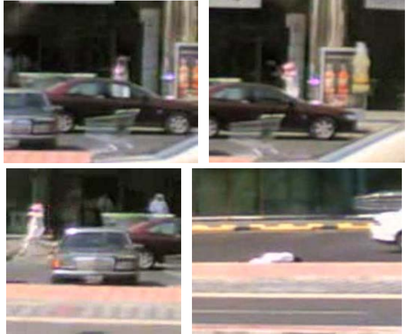
Saleh al-Harbi attempts to flee the Panda Supermarket and engages in a fatal shoot-out with Saudi police