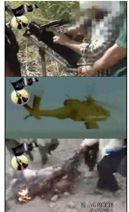
Members of Al-Qaida’s Aisha Brigade down a U.S. Apache helicopter in Al-Yusififiya in April 2006 and mutilate the remains of an American pilot