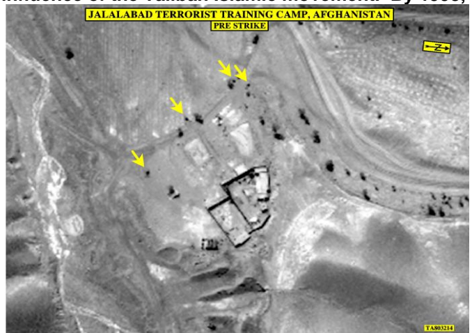
Satellite photo of Al-Qaida terrorist training camp near Jalalabad, Afghanistan

Following his split from the GIA in Europe, Abu Musab al-Suri departed for Afghanistan which had once again become a haven for Al-Qaida under the growing influence of the Taliban Islamic movement. By 1998,