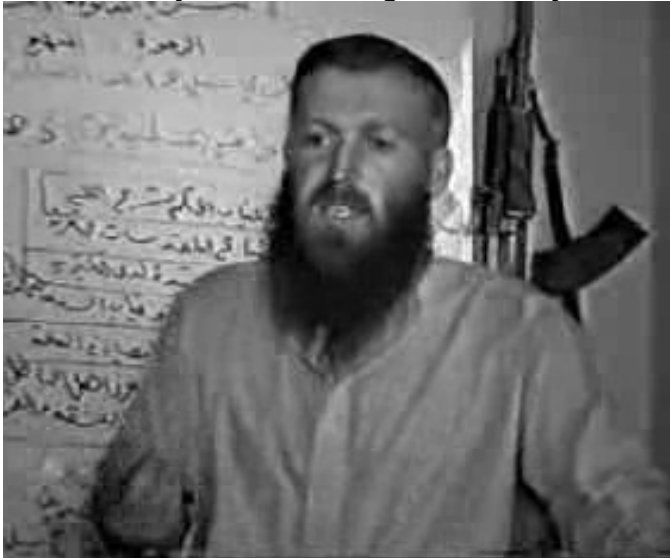
Abu Musab al-Suri teaches his followers about jihad with an AK-47 rifle at his side

"I last saw Shaykh Usama [Bin Laden]—may Allah protect him—in November 2001 during the battles to defend the [Taliban] state. We reminisced about our pledges [of allegiance] to [Mullah Mohammed Omar] and I offered him an oath for jihad and to fight against our enemies. This is exactly what I am doing now with my hand and my pen, whenever I can, if Allah wills it. Today, our