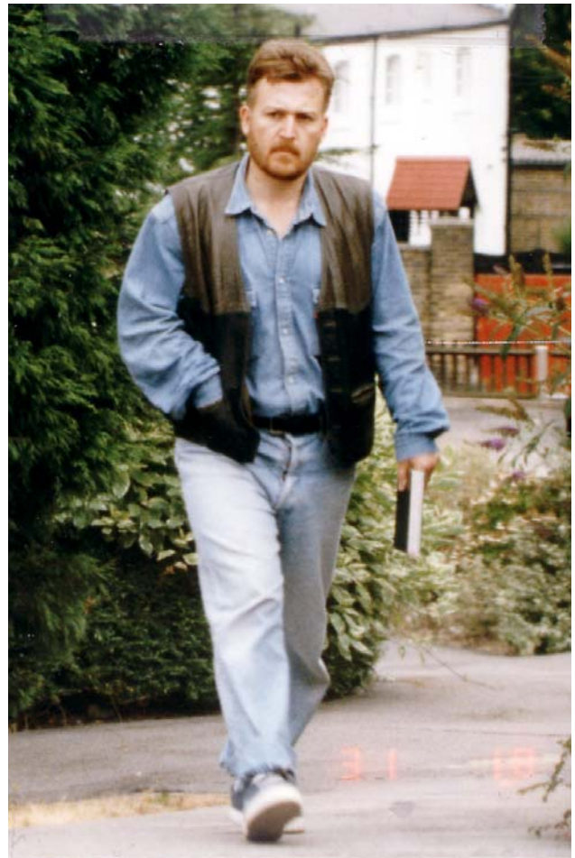
Wanted terrorist mastermind Abu Musab al-Suri (a.k.a. Mustafa Setmariam Nasar)

“I was honored to participate in the Afghani jihad against the Russians and the communists until we exterminated their forces and lowered their flanks and made an example out of them—as we will also do with America, with the help of Allah... I was honored to become acquainted with Shaykh Abdullah Azzam, and I worked with him during the days of the Afghani jihad in 1987. Then in 1988, I was honored by coming to know Shaykh Usama [Bin Laden]... I was honored to become a member of Al-Qaida, and I worked with the group until 1992. During that time, I trained its first elite fighters and I was an instructor at its camps and other Arab-Afghan camps in various military and organizational methodologies, especially given my own high-degree of specialized training in explosives production, special operations, and guerilla warfare that I received in Jordan, Iraq, and Egypt. All praise be to Allah for his blessing.”