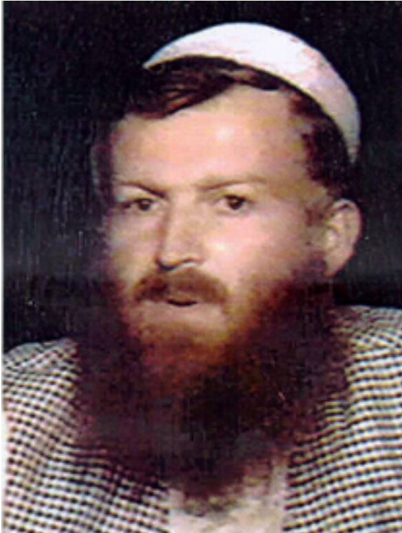
Wanted terrorist mastermind Abu Musab al-Suri (a.k.a. Mustafa Setmariam Nasar)

it. At once the French government cracked down on them heavily to block news from being heard. They were then forced to move to other countries, which allowed more freedom of speech, such as England, Sweden and others. It was then when al Ansaar magazine was issued, mainly to support the GIA, on a weekly basis. Al Ansaar group was fought viciously by other Algerian groups in Europe who were secularist or pro Democracy, such as FIS, with all of its factions.”