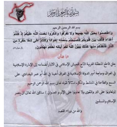
Alleged statement from IAI fighters in Anbar swearing loyalty to Al-Qaida’s “Islamic State of Iraq”, December 2006

Over the past year, factions within the IAI have been increasingly drawn into the orbit of Al-Qaida’s Mujahideen Shura Council and, later, the “Islamic State of Iraq.” In early December, a copy of a statement branded with the IAI logo appeared on the Internet that was not officially released by the IAI’s media wing. According to that statement, IAI units based in the western Anbar province have already agreed to join Al-Qaida’s Islamic State and have even sworn an oath of allegiance to Al-Qaida’s newly-appointed “leader of the faithful” in Iraq, Abu Omar al-Baghdadi. For months, the IAI’s media wing remained conspicuously silent regarding these rumors and other reports of high-level, ongoing negotiations with Al-Qaida leaders—until April 5, when it released the following communiqué through its official website and other credible online jihadi news sources.