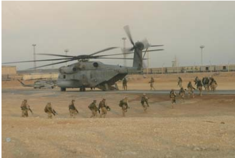
U.S. Marines board a CH-53 Sea Stallion at Forward Operating Base Camp Al-Qaim