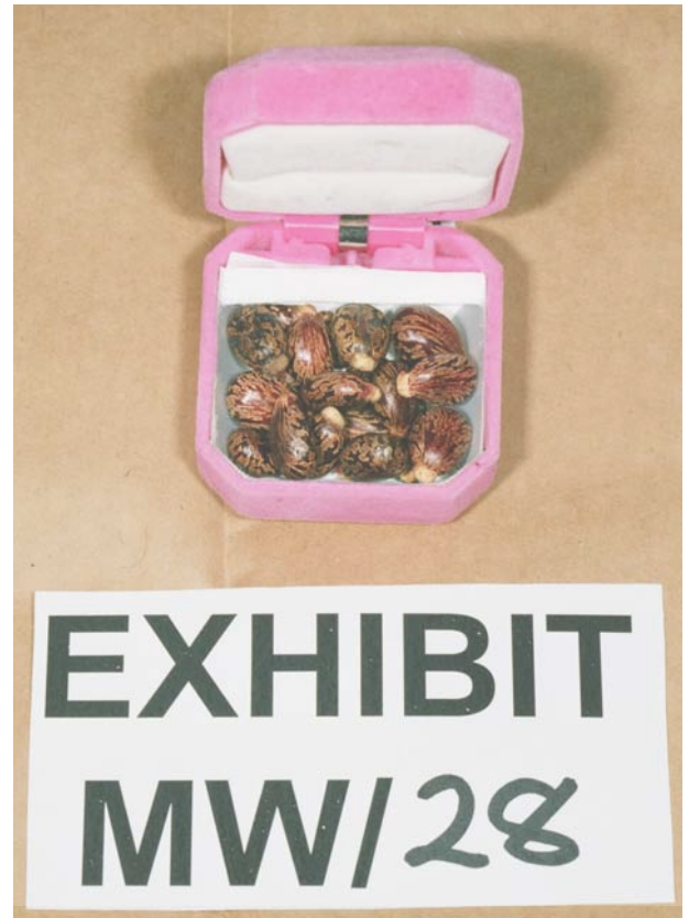
At left: An Arabic-language guide to producing Ricin, seized in north London, January 2003. At right: Castor beans (the primary ingredient in Ricin), seized in north London, January 2003.