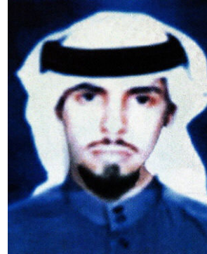
Saleh bin Mohammed al-Aoofi (a.k.a. Abu Abdullah), leader of Al-Qaida in Saudi Arabia