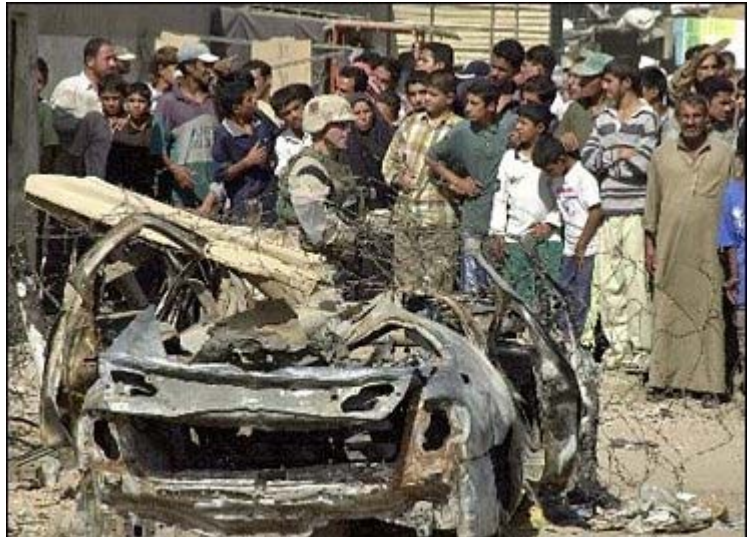
A U.S. soldier stands guard following an Oct. 9, 2003 suicide bombing at a police station in the Baghdad suburb of Sadr city.

“A different target was later selected. We were now monitoring the first police station that would be targeted in Iraq. It was a nest of corruption and promiscuity. It was also located in an area that was infamously known for blatantly cursing our Umm Aisha, may Allah bless her—let alone our Shaykhs Abu Bakr and Abu Umar, may Allah bless them. The target was the Sadr city police station located in the Jamila district. There were more than a hundred and fifty vermin that would line up in rows at the outdoor courtyard of the police station at eight o’clock each morning. We selected Thursday as the day in which we would carry out the operation. One of the brothers later came up to me and asked me to postpone the operation to Saturday, because there were usually less [civilian bystanders] on Thursdays. Abu Khaled was right next to me when the brother made his request. I told the brother, ‘We have made our decision and Allah will reward us, even if there seems to be a problem with carrying out the attack on Thursday.’”