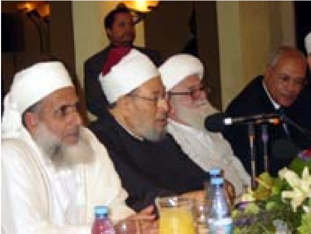
An IAMS Panel including its President Yusuf Qaradawi